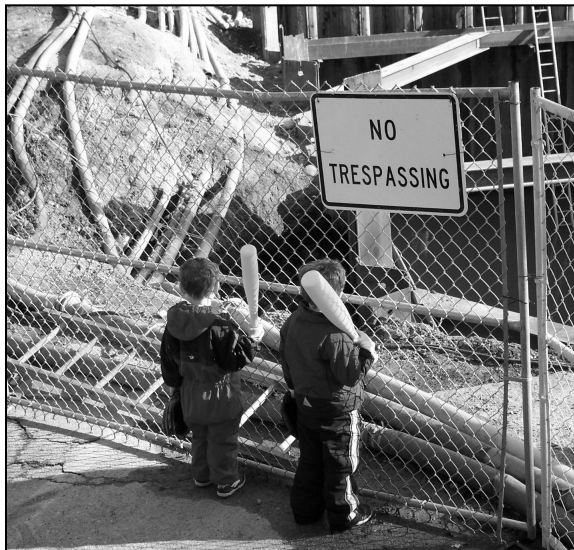
"No place to play?"

redone this year. The Highway 67 Project required a major storm water drainage system from the highway down Fontana Boulevard, across the park and into the lake. The Main Lift Station required almost identical routing. We wanted to save you more headaches, inconvenience and taxpayer money by doing these two projects simultaneously. If we did not fold