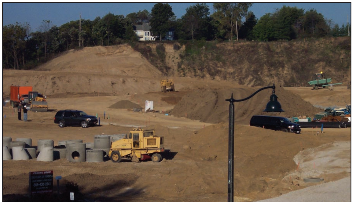
Photograph from Highway 67 facing west of the Par Development Cliffs of Fontana subdivision site.

NOTICE: All delinquent Village of Fontana Utility Bills not paid by November 15, 2007 will be subject to interest and added to the 2007 VOF Property Tax Bills.