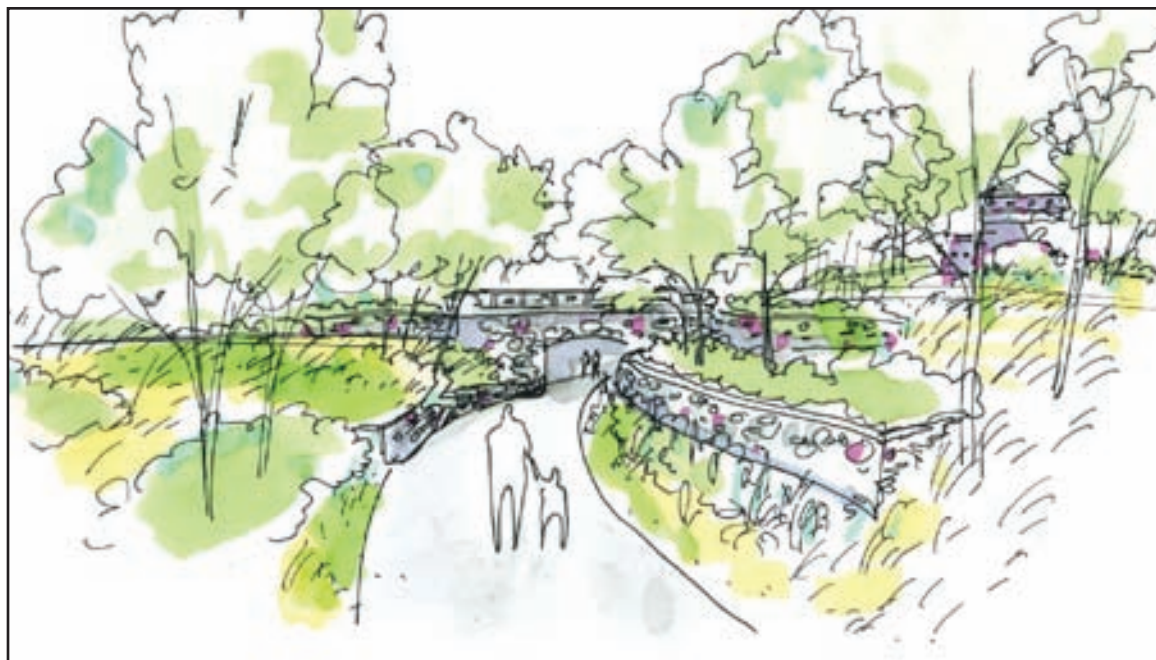
This illustration is an artist's rendering of the view from Highway 67 of the pedestrian underpass being constructed at the intersection of Wild Duck Road and Dade Road.

"The CDA's opening project included a new sidewalk from State Highway 67 all the way to the Fontana Elementary School along the south side of Main Street."